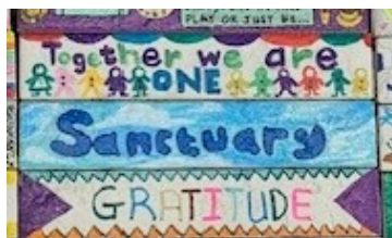
Close up of some tiles

Birmingham Warm Welcome aims to ensure that our communities have access to safe, welcoming, warm spaces where the focus is not upon poverty or an inability to afford heat but is dignified and does not enhance the stigma and shame associated with poverty and financial difficulty. We do this by offering hospitality and connection; connecting people to each other, services, wellbeing activity, opportunity, and warmth.