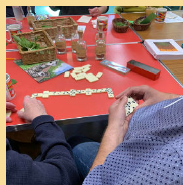
Some of the activities enjoyed by participants at Memory Café

Body Mind Spirit Partnership hosts locally based activities inviting the participation of over the 50's through our churches and church-linked partners across the city using a participant-led and participative approach improves wellbeing, grows meaningful relationships that invite others to join in and builds generous community where they live.