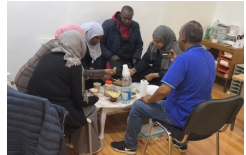
Attendees enjoying warmth and community

Birmingham Warm Welcome aims to ensure that our communities have access to safe, welcoming, warm spaces where the focus is not upon poverty or an inability to afford heat but is dignified and does not enhance the stigma and shame associated with poverty and financial difficulty. We do this by offering hospitality and connection; connecting people to each other, services, wellbeing activity, opportunity, and warmth.