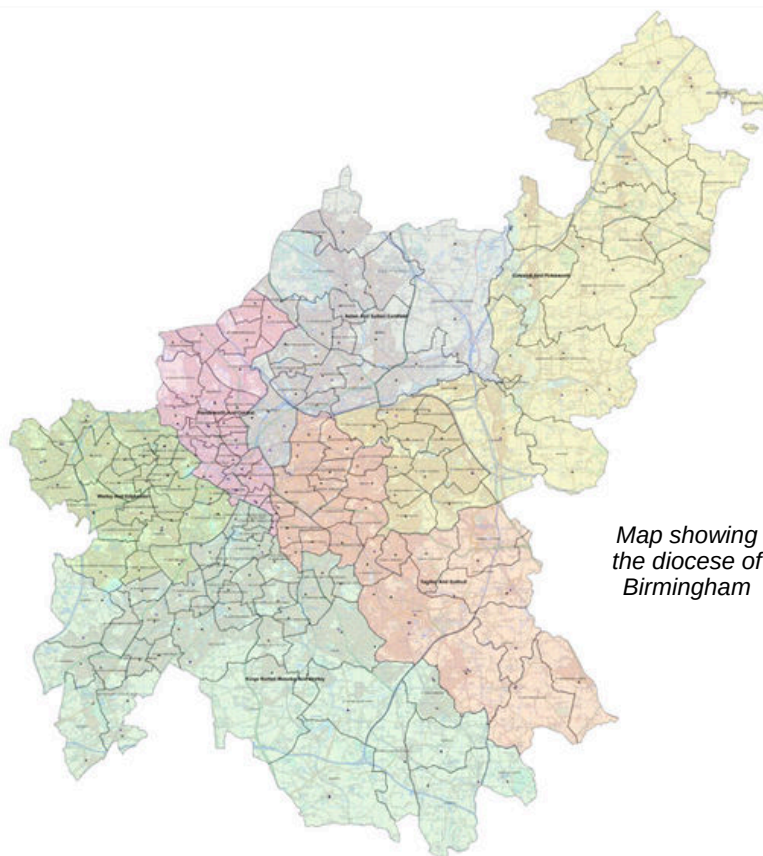
Map showing the diocese of Birmingham

We recognise that we are not alone in this approach and that we achieve progress because we collaborate with a wonderful, wider movement of people who are motivated to make a difference in their neighbourhoods, communities and in the lives of those around them, especially those living at the sharp end of poverty.