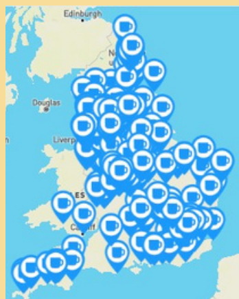
This map shows England dotted with 700 Places of Welcome around the country

Many of the Birmingham Places of Welcome have joined the Warm Welcome movement in the city.